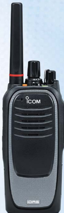
VHF DIGITAL TRANSCEIVER IC-F3400D UHF DIGITAL TRANSCEIVER IC-F4400D