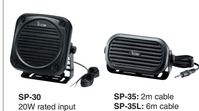
SP-30 20W rated input