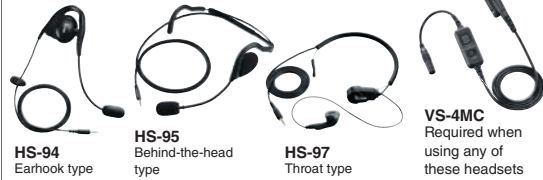
HS-94 Hook type