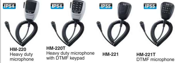
HM-220 Heavy duty microphone