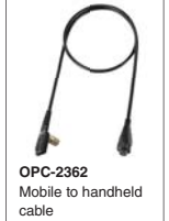
OPC-2362 Mobile to handheld cable