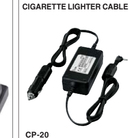
To operate from a 12 or 24 V DC power source socket.

SE for Europe version, SV for Australia version BELT CLIP