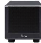
SP-38 High quality audio and matching height Maximum input: 7 W